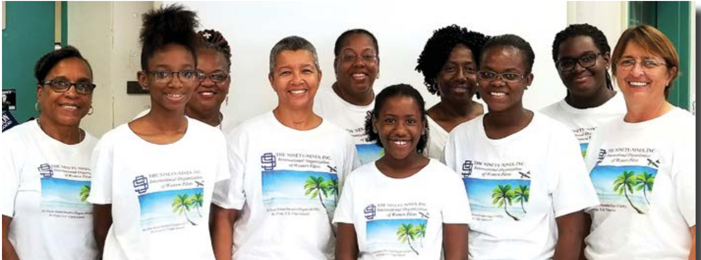
Members of the St. Croix Island Paradise Chapter gather for a photo after a recent Chapter meeting.