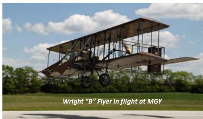
Wright "B" Flyer in flight at MGY