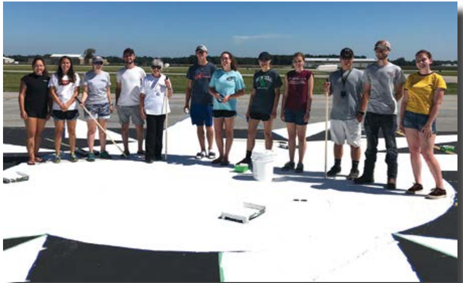
Members and friends of the Greater St. Louis Chapter created a new compass rose at the Southern Illinois/Carbondale airport just in time for October 2018 AOPA Fly-In.

We were proud to have our work on display for the AOPA