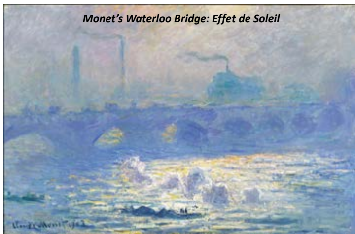
Monet's Waterloo Bridge: Effet de Soleil

This tour focuses on the heart of the Dayton Aviation Heritage National Historical Park. It commemorates three important historical figures and their work – Wilbur Wright, Orville Wright, and poet Paul Laurence Dunbar. Visit the Wright Cycle Company where the Wright Brothers became actively interested in powered flight. The Wright-Dunbar Interpretive Center tells the story of how the Wright Brothers' lives intersected with poet Paul Dunbar, and it is the site of the Wright Brothers printing shop where Dunbar published The Daily Tattler newspaper. An African American, Dunbar was one of America's greatest poets and a lifelong friend of Orville Wright. In the Interpretive Center, you will also find the Parachute Museum and learn about the development of the free fall parachute.