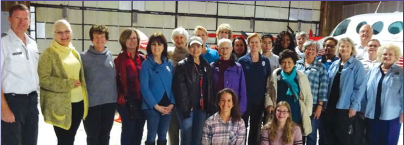
Chicago Area Chapter members enjoyed presentations at their recent meeting at Clow International Airport.