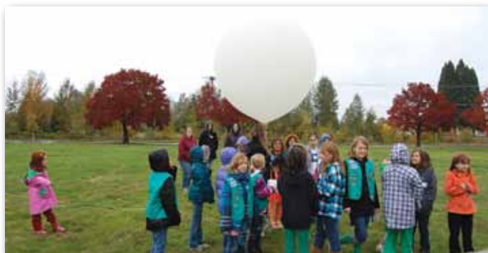
Girl Scouts launch the radiosonde balloon at Salem, Oregon.