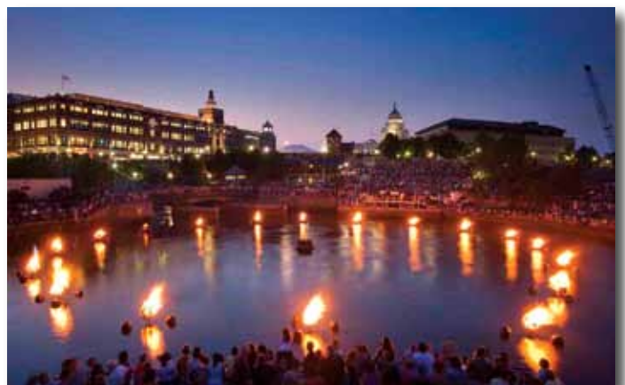
Waterfire on the Providence River will be a Saturday night highlight of the Conference.