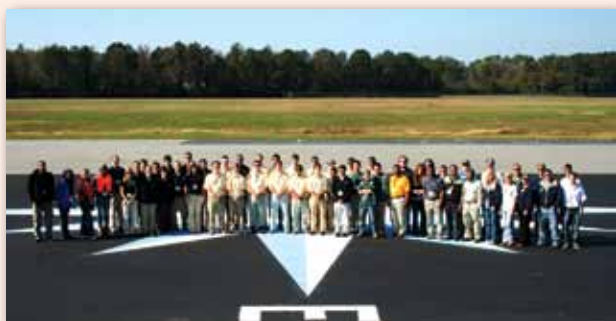
NIFA regional participants line up for a photo on the new compass rose painted by Hampton Roads Chapter members.