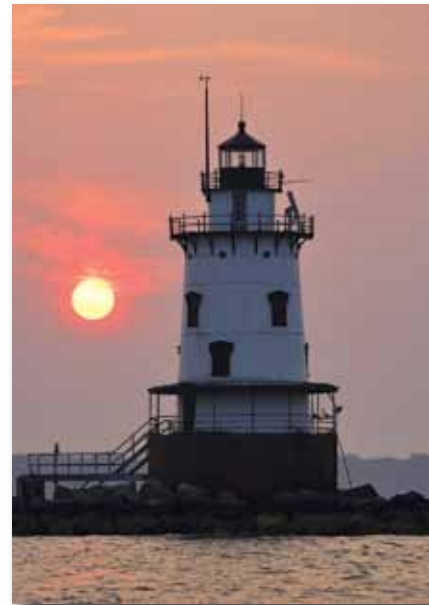
View 10 historic lighthouses on one of the 2012 Conference tours.

Listen to a storm-at-sea story that beats them all, as told by one of the two helicopter rescue pilots that ditched in the Atlantic Ocean in the middle of that storm. Lieutenant Colonel Graham Buschor was Commander of the 101st Squadron at the 106th Rescue Wing of the New York Air National Guard on Long Island. Surviving for five hours in the frigid water with over 60-foot seas and 120 mile-per-hour winds before being rescued by a Coast Guard ship, Lt. Col. Buschor will take you into the heart of the storm and describe a pilot's mission to save lives while placing his own life in peril. The episode is detailed in the Sebastian Junger book, The Perfect Storm .