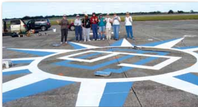
Airmarkers at Sebring Airport display both their new airmarking and their inevitably blue hands.