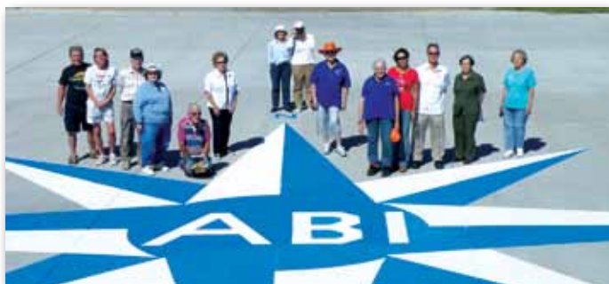
Airmarkers at Abilene Regional Airport.