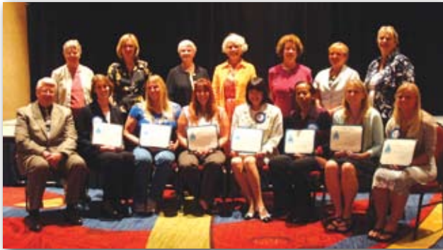
Current and previous AEMSF recipients were honored at a Conference luncheon. Also recognized were the judges and AEMSF Trustees.