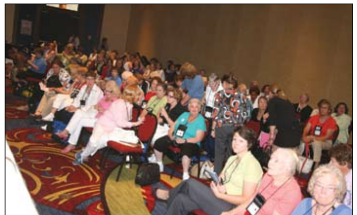
Ninety-Nines settle in for the start of the Business Meeting.

Future conference dates are: Kona, Hawaii, July 5-9, 2010; Oklahoma City, Oklahoma, July 12-17, 2011; Providence, Rhode Island, 2012.