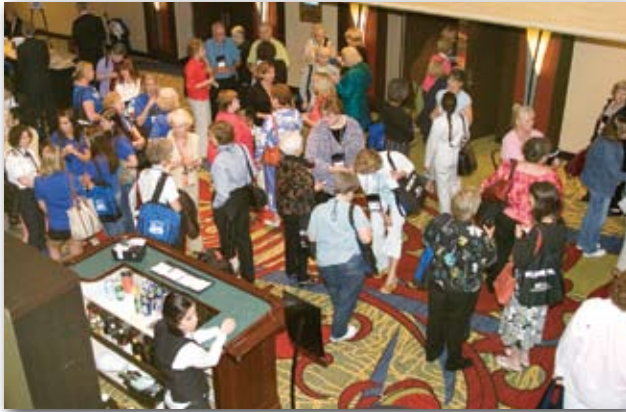
Ninety-Nines mingle during the break between the Business Meeting and the AE Scholarship Awards Luncheon.