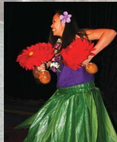
A dancer encourages the audience to try the hula.