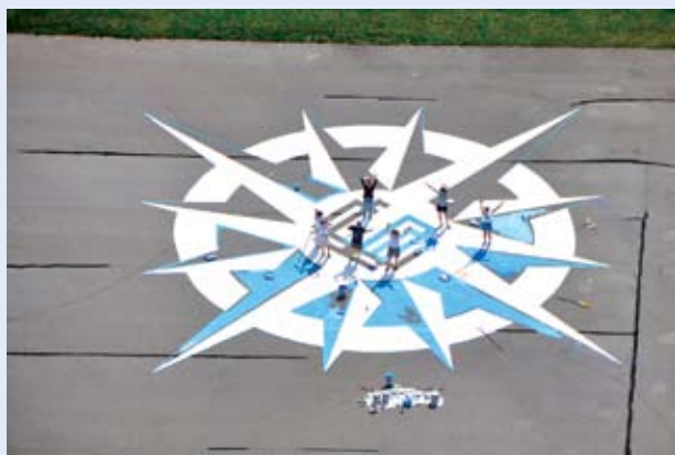
Washington DC Chapter members work on the compass rose at KGAI, having fun despite the 90-degree heat.