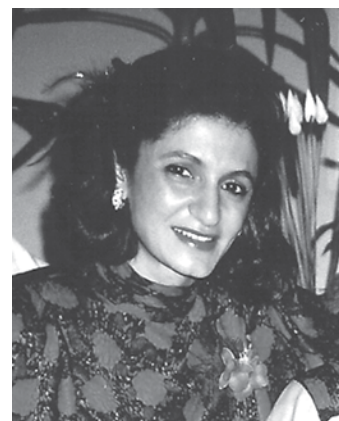
Randa bin Laden.