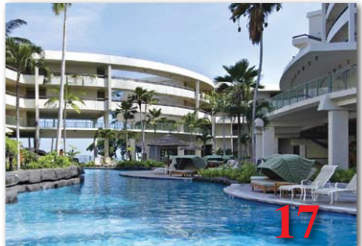
The 2010 International Conference will be held at the Sheraton Keauhou Bay Resort and Spa on the Kona Coast July 5-9.