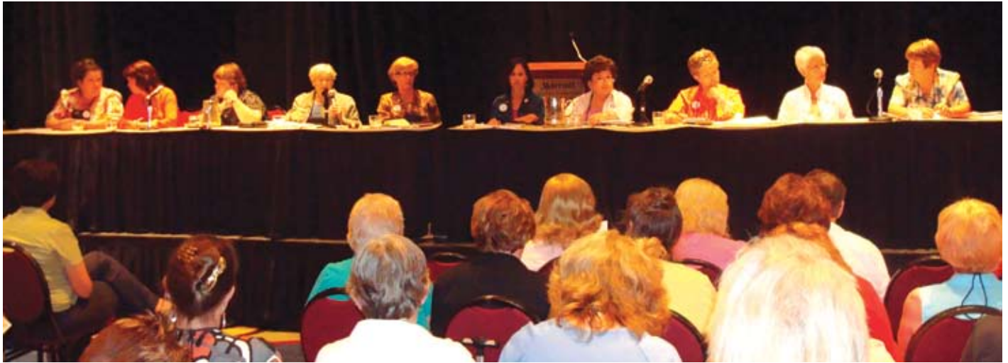
International Officers address Ninety-Nines official business at the 2009 International Conference in Chicago.