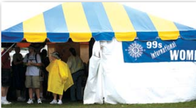
The 99s Tent was a good place to find shelter from the rain at Oshkosh during the post-Conference tour.