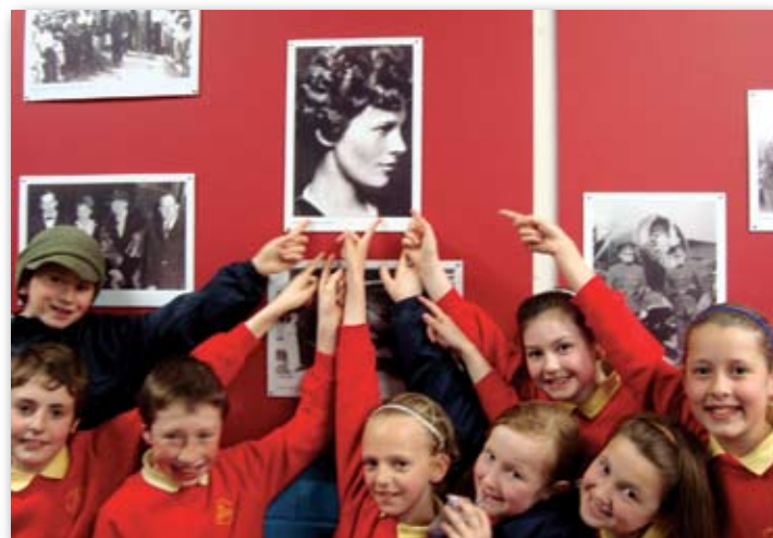
Children from grade P6 at the Amelia Earhart Interpretive Centre festivities.