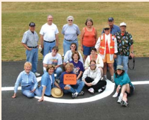
Mt. Tahoma and Seattle Chapter members airmark Shady Acres airport.