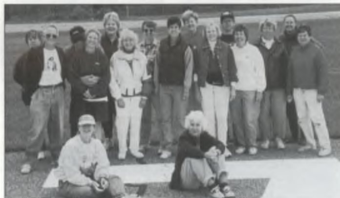
Eastern Pennsylvania 99s at Pottstown Municipal Airport airmarking.