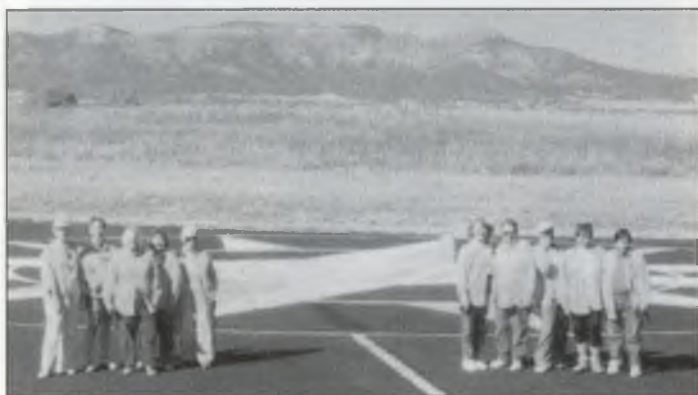
Scioto Valley 99s with Compass Rose painted at Raton, New Mexico, airport.