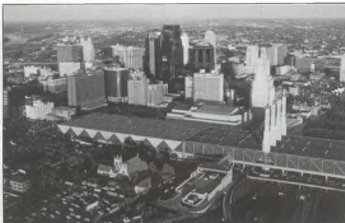
Kansas City, Missouri

Thursday we conduct the business of The 99s Corporation. We send the 49 1/2s and other guests on a tour of the Airline