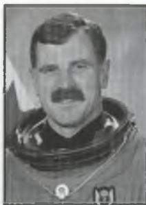
Dr. Dave Williams