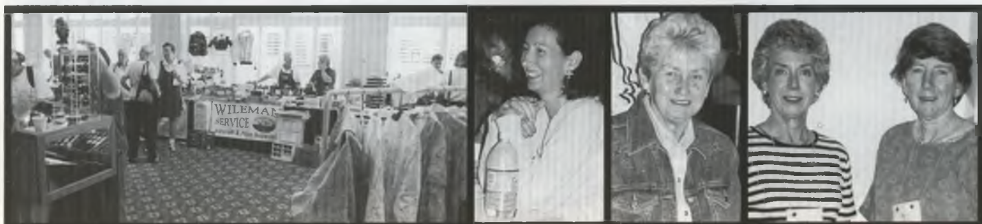
Fly Market had lots of aviation type items for sale