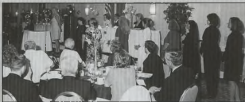
Parade of past Amelia Earhart Memorial Scholarship winners.

Next year the Conference is in Calgary. And sure, it's a little cooler up there, but just as beautiful, and with a quick jump and a skip from Washington State, I'll be there. Besides, I believe the Southwest Section is planning a fly-in to Calgary about that time. So start saving your pennies! And I'll see you there.