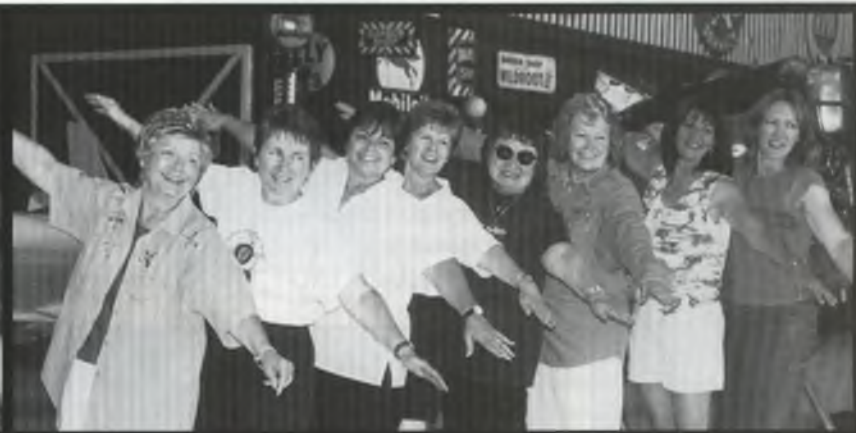
San Fernando Valley members at Gillespie Field