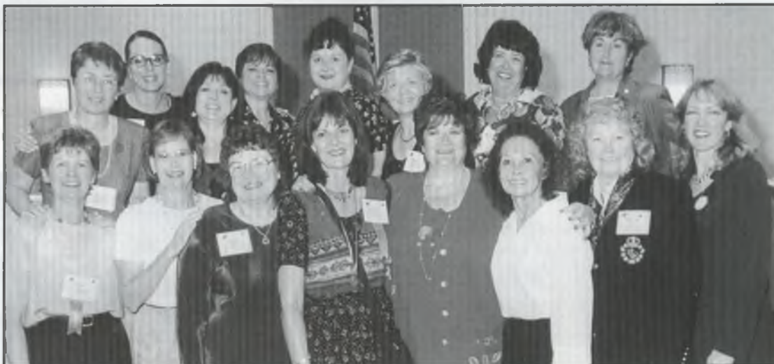
A happy group shot of some of the past scholarship winners at the AE banquet.

The banquet was climaxed with the very emotional Parade of Past Winners who told about how their scholarships helped them in their careers. To end this perfect evening, all 450 attendees were invited to mingle with our honored winners.