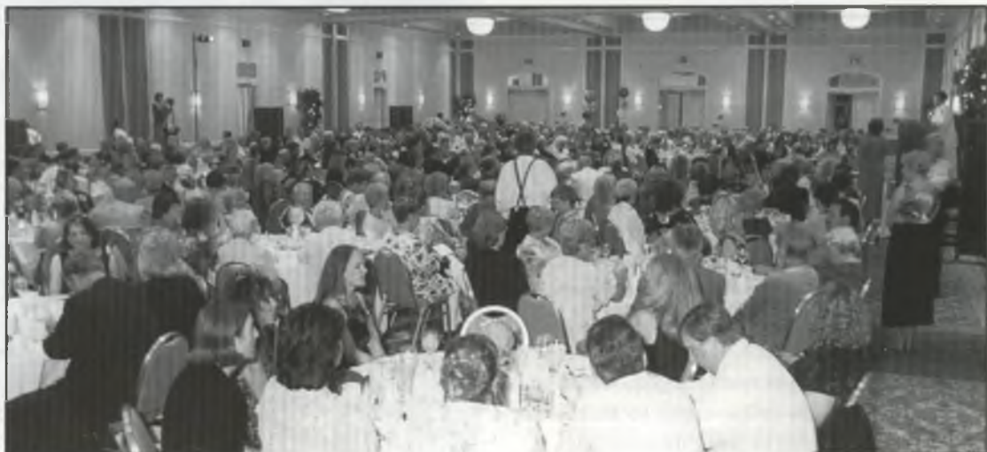
Ninety-Nines and their guests at the closing banquet.

Our experiment to change the AE Scholarship awards presentation to a Friday night dinner proved to be another success. Almost all winners were on hand to receive their awards.