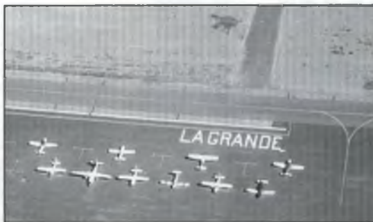
LaGrande Airport, Oregon, with its repaint job.