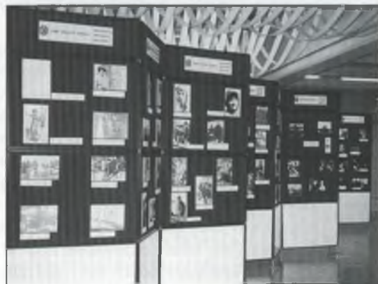
The 99s impressive exhibit at Finnish Aviation Museum.

airline pilots' uniforms, Finnish aviation awards, air racing photos and photos of almost every Finnish woman pilot to date. There are also displays featuring Amelia Earhart and the AE Birthplace Museum.