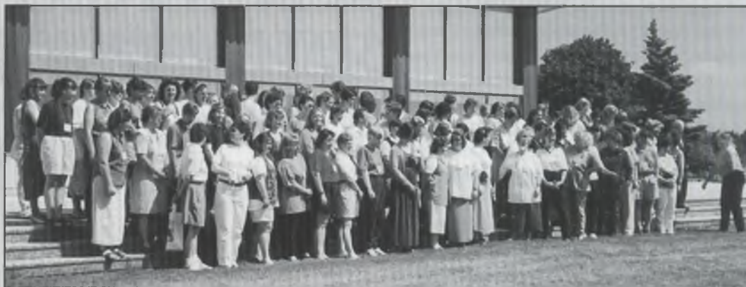
Some of the Canadian women attending the Canadian Women in Aviation Conference in June last year on the campus of the Belleville Loyalist College near Trenton, Ontario. The conference was held in conjunction with the East Canada Section Meeting whose theme was "A Celebration of Women."