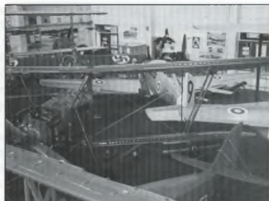
Static aircraft display at Finland's first air museum.

The large and very impressive display shows women pilots in Finland from early days to present day activities. In addition to a rather comprehensive history of The 99s, the exhibit includes a simulator,