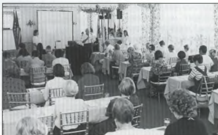
Palomar Chapter members conducting Flying Companion Seminar at ABS Convention in San Diego, California.