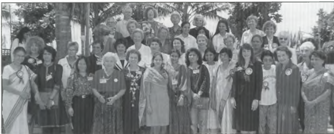
The Second World Aviation Education & Safety Congress participants, Mumbai, India, March 1994.