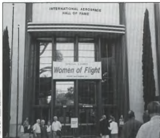
San Diego Aerospace Museum

You can check out the long list of activities available in San Diego on www.sandiego.org