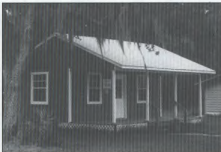
An example of what the new 99s building at Sun 'n Fun will look like when it is completed later this year.