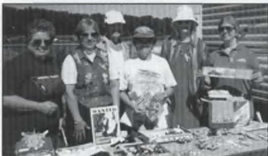
Indiana Dunes Chapter members at EAA Pancake Breakfast Fly-in at LaPorte Airport.