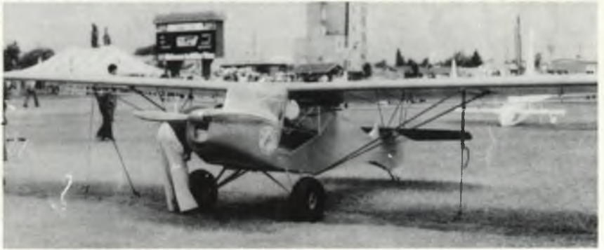
AIN'T SHE SWEET —Here's a taildragger version of the kit-built Avid Flyer, seen at Oshkosh, where she has been a hit from her debut onward.