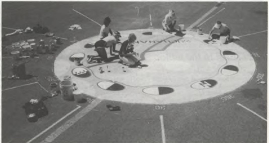
ANOTHER ROSE BLOOMS —Members of the Mt. Diablo Chapter freshen the paint on this faded beauty at Concord. The paint party happened August 6.