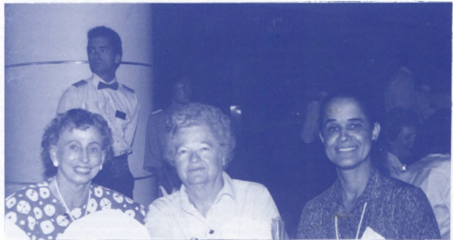
A good representation of Sections was found at the week long convention.