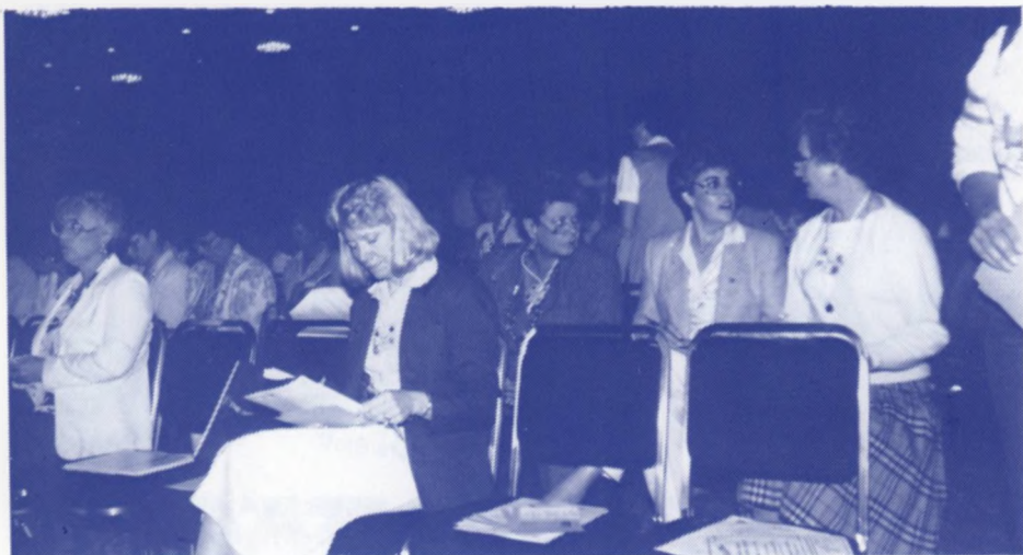
Thursday's business meeting was well attended by 99s