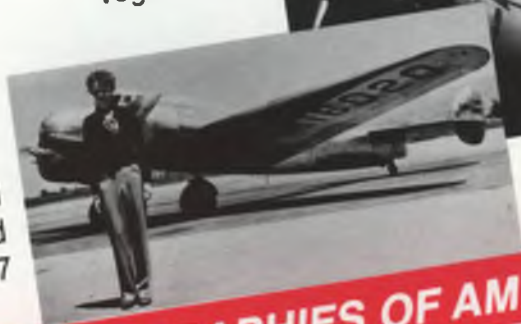
Amelia and her Lockheed Electra - 1937