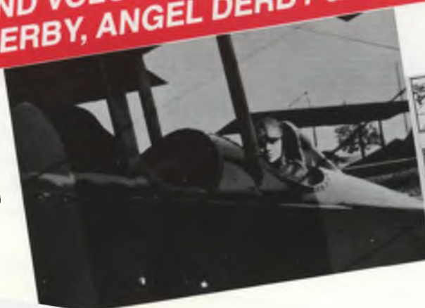
Amelia learning to fly - 1921