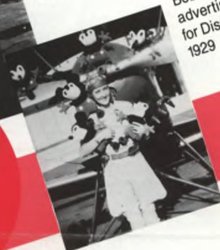
Bobbi Trout advertising for Disney 1929

PHOTOS & DOCUMENTS IN THE TIMES INCLUDING... ...EACH BOOK A CLASSIC!