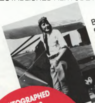
Bobbi ready for first "Powder Puff Derby" - 1929

AUTOGRAPHED EDITIONS PRE-PUB. PRICE $27.50 EA. BOTH FOR $49.50