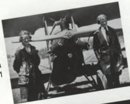
Amelia on last departure from Lae, New Guinea - 1937