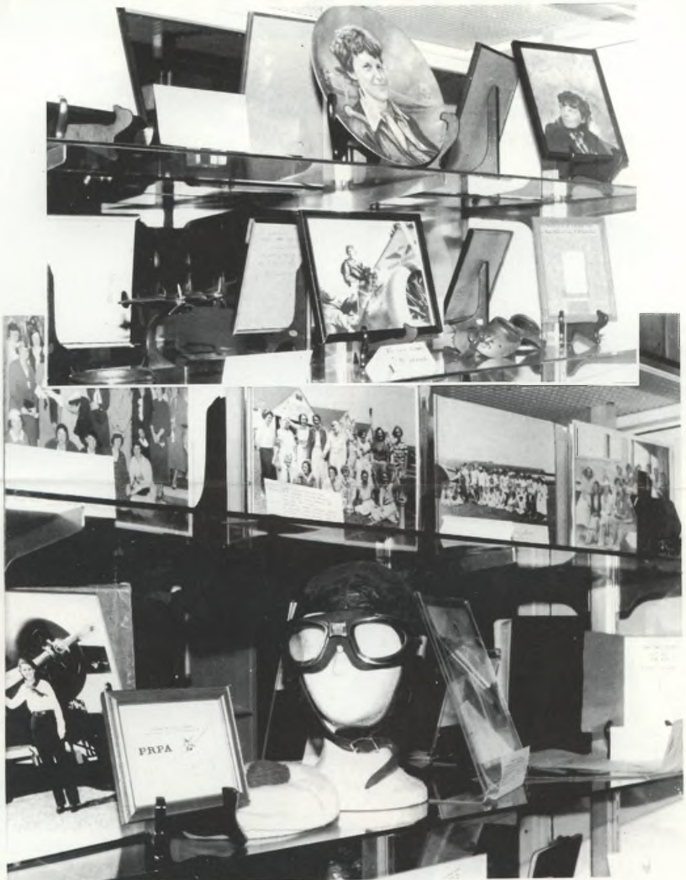
The photos above, are of some of the display cases which house priceless memorabilia from the early days of women pilots who have been members of the only international association of women pilots, The Ninety-Nines. The headquarters at Will Rogers World Airport has run out of space for additional display cases, and soon will expand to provide needed room.