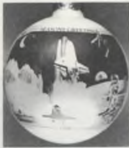
25 ANNIVERSARY SPACE EXPLORATION

3 1/4" Glass Ornament • Dated • Artist Warren Green's Rendition of These Historic Events • $5.50 each plus $1.25 postage & handling per item — SEND OR CALL FOR FREE COLOR BROCHURE.