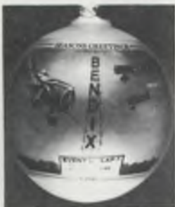
1932 AIR RACES EARLY FLIGHT