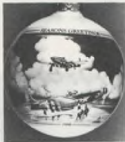
P-51 MUSTANG MILITARY