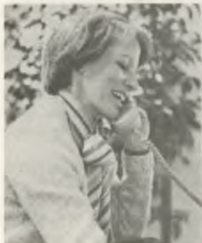
Nancy Landon Kassebaum