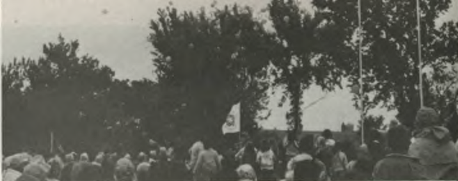
As a finale, blue and yellow numbered balloons were released by the children, and quickly disappeared from view in the gusty wind.