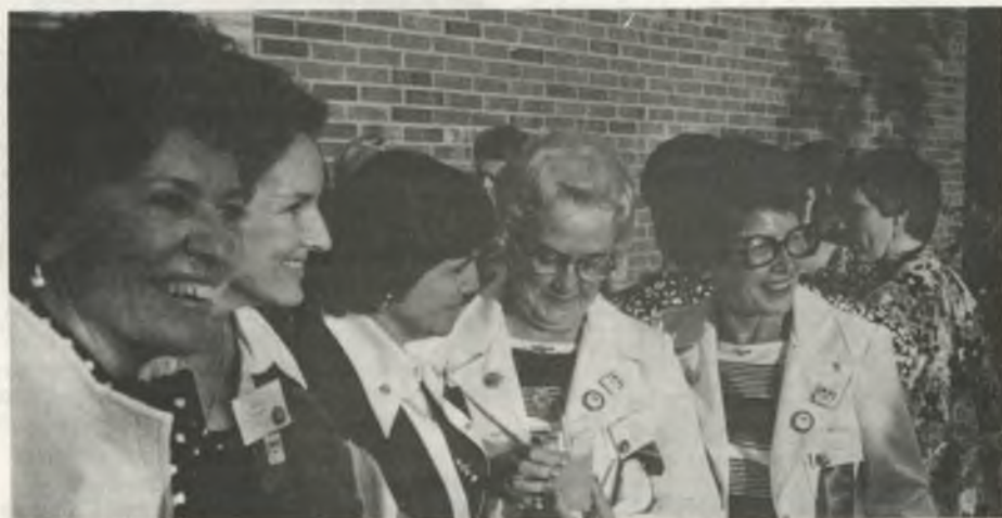
During a break in section meeting activities, 99s have a chance to visit (hangar-fly) with friends.