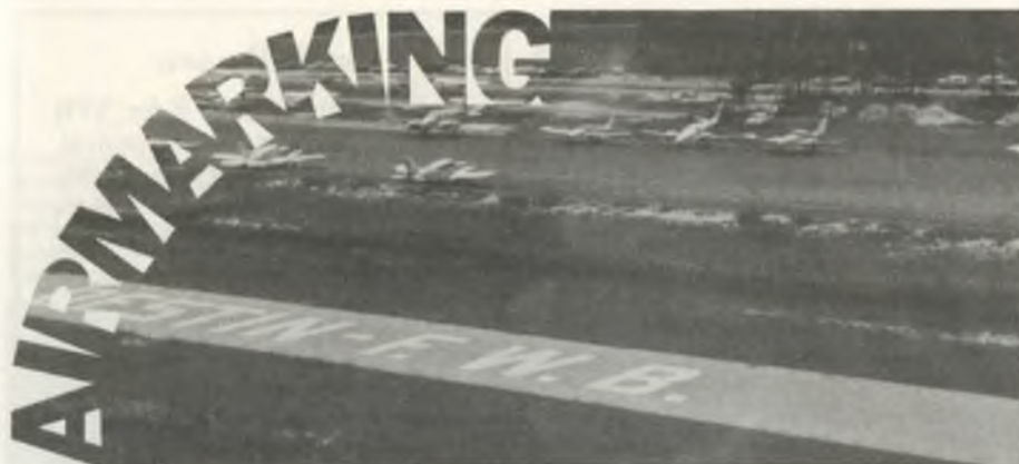
Florida Panhandle Chapter painted Destin Airport at Fort Walton Beach, Florida.