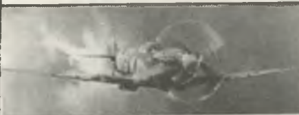
AVIATION ART PRINTS—BEAUTIFUL 48 PAGE COLOR CATALOG SEND $2 TO AEROPRINT, 405 MONROE ST, BOONTON NJ 07005