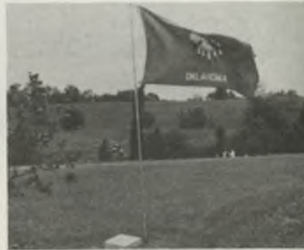
One final walk through Memory Lane, and then it was time to fly away home...