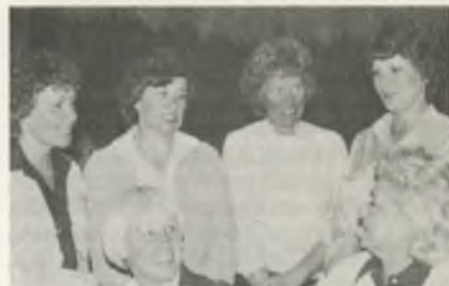
Colorado 99s extend an invitation to Spanish Peaks members to join in a fly-in picnic.