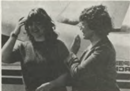
99s arriving at North Central Section's meeting were greeted with a stiff surface wind.