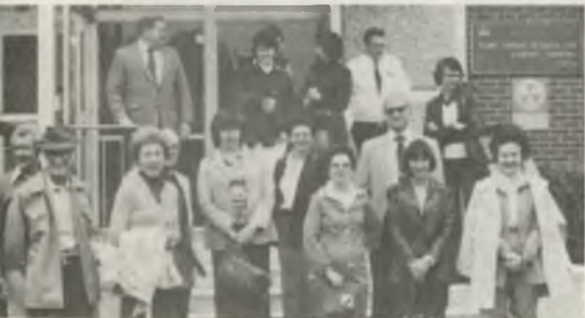
Washington D.C. 99s pause outside of Flight Control Research Lab during their tour of NASA Langley Research Center.

On April 22, the D.C. chapter was granted special permission to land at Langley AFB, Virginia. We taxied to the NASA Langley Research Center hangar and were met by Guy Boswick from NASA's Office of External Affairs. The seventeen 99s and guests boarded a bus for a tour which included the Impact Dynamics Research Facility where general aviation aircraft are crashed at different angles for crash worthiness, the Visitor's Center with its many displays, a "Unitary Plan" wind tunnel, the Differential Maneuvering simulator, and the Visual Landing Display System — a 24 ft. by 60 ft. dual scale terrain model used by various simulators at Langley. We also talked to one of the test