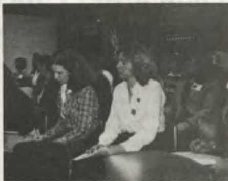
Aviation career-minded young people learn what is available to them at a recent Aviation Careers seminar.