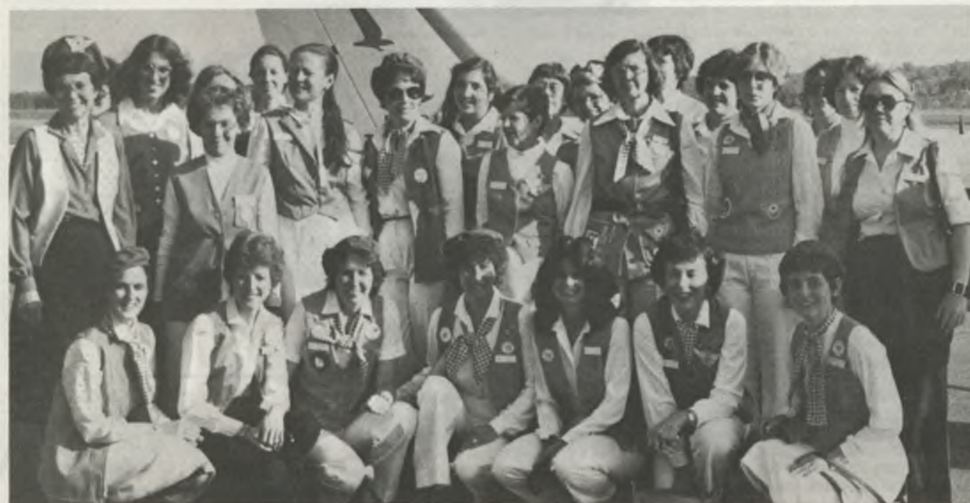
Minnesota 99s arrive at Downtown St. Paul Airport to participate in Red Cross Recognition Day for Lifeguard Flights.

Minnesota 99s began flying blood, collected by the Red Cross at distant points from voluntary donors, back to the St. Paul Airport where it is picked up by Red Cross Volunteer Drivers and quickly transported to a nearby lab for processing into components. The flights are necessary because when whole blood is to be made into components (red cells, platelets, cryoprecipitate, etc.), the process must begin and be completed within a few hours of collection. Many of the collection sites are so far from the St. Paul processing and component laboratories that transporting the blood by automobile isn't feasible.