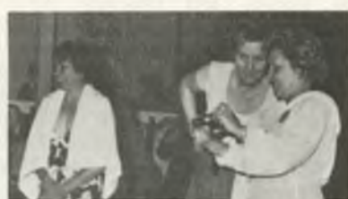
Friday evening's pool party was fun for 99s attending the North Central Section meeting in Ann Arbor, Michigan.

On Wednesday, May 12th, nine of our members flew to Jefferson City, Missouri for the signing of "Women in Aviation