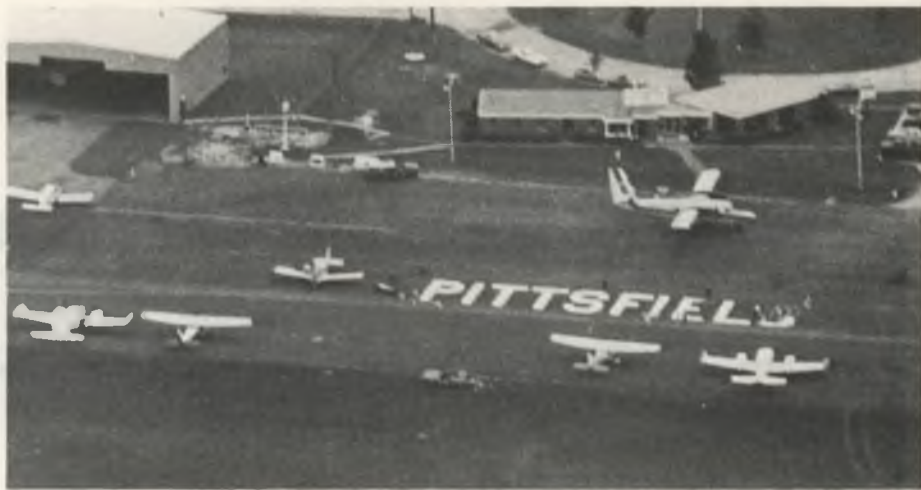
On August 5, the 99s of the Western New England Chapter and family helpers were caught in action as they put the finishing touches to their 20-foot-high letter "D" at the Pittsfield Airport in the beautiful Berkshire Hills of western Massachusetts.

The women went through the same rigorous jet training as the men followed and