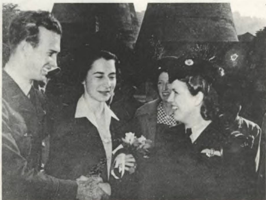
Jacqueline Cochran attends the wedding of one of the women pilots she recruited to serve in England.