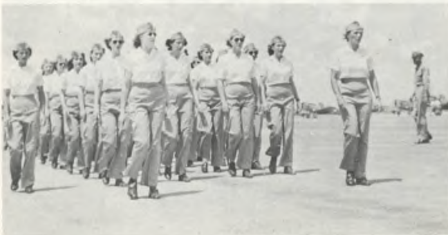
Close order drill by the trainees at Sweetwater, Texas, under the critical eye of an Air Force Officer, was part of the regular routine. There was no difference in the WASP training program and that of the male Air Force cadets.