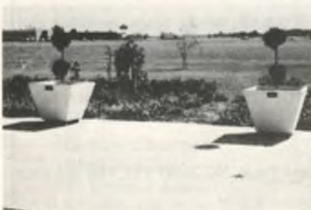
The newest gift to Headquarters are these two large white planters which were presented by the Tennessee Chapter.