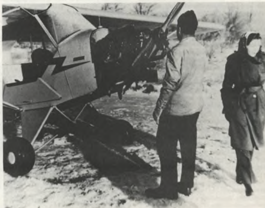
Lauretta B. Foy, WAFS stationed at New Castle Air Base, walks away from a forced landing in a Cub, after finally getting aid. This was on "Icicle Lane" en route to a delivery in Canada.