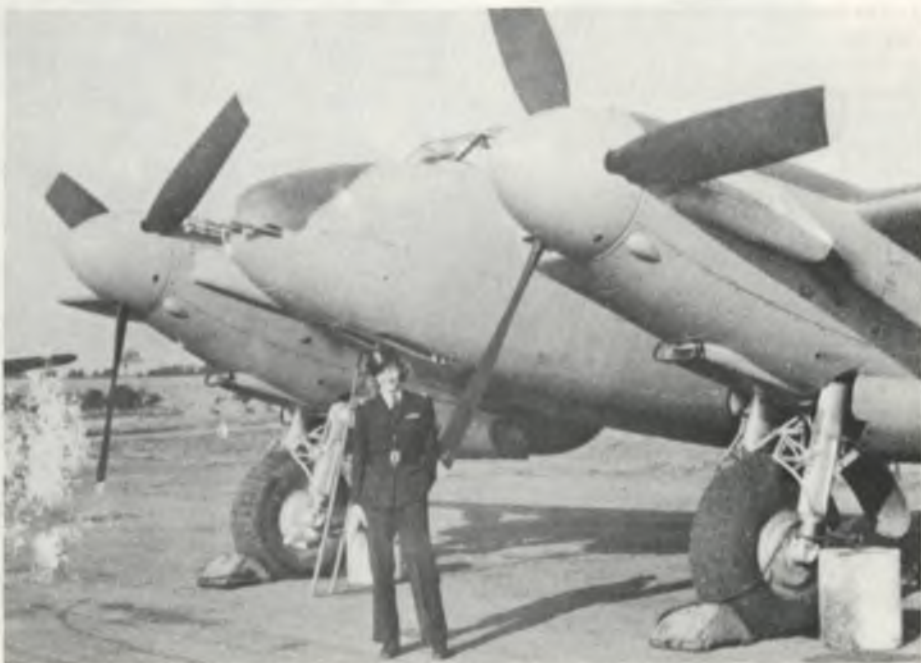
Sue Ford, flying for the RAF, shown with the "little doll baby" DeHaviland Mosquito—"a dream to fly".

Some civilian instructors had to be fired as well. There wasn't supposed to be any