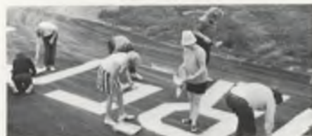
Central Pa. Chapter members airmarking at Oregon Hill