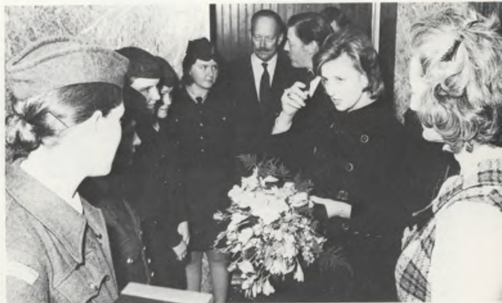
The Girls Venture Corps formed the Guard of Honour for their President, HRH Princess Alexandra and her husband the Hon. Mr. Angus Ogilvy.