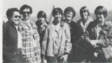
Mt. Diablo Chapter: South County Fly-In.

Our next fly-in will be March 21st to Sacramento Metro (weather permitting). Anyone wishing to join us would be most welcome.