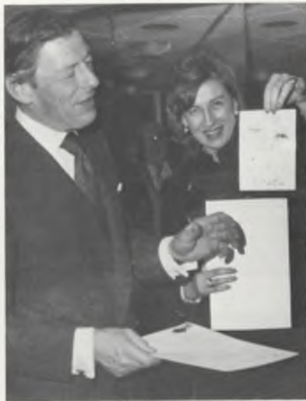
Princess Alexandra, and her husband, the Hon. Angus Ogilvy, accept souvenir certificates of Sixty Six & Thirty Three — with some Governor's advice!

A large group of us adjourned to Mr. Chow's restaurant for dinner, and a few stalwarts closed the proceedings next morning by closing Raffles' night club too!