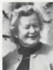
..... and Today.

California Chapter Histories will be concluded next issue.