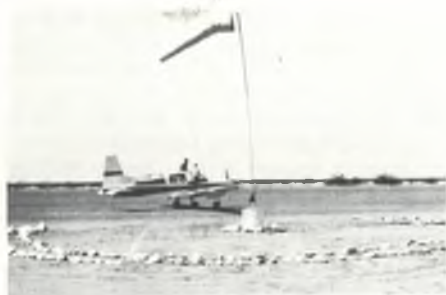
Auxiliary No. 4 landing strip - Yuma, Arizona - showing new wind sock, rock circles, painting...and first plane to use the new sock.

"Yes, I could see the sock just fine," said the pilot of the plane shown. He landed with an emergency: two of the three children taking a ride with him had just been violently ill!