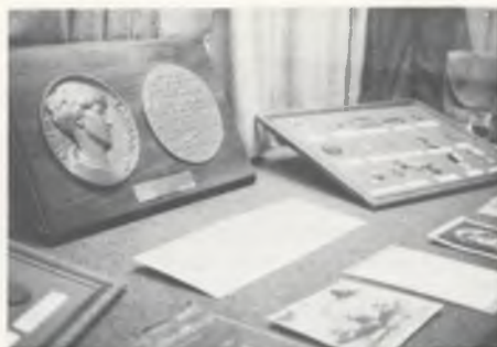
Women in Aviation Day