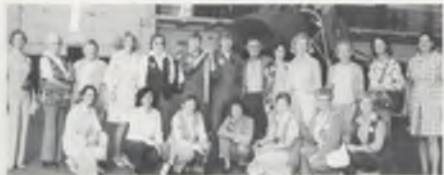
Florida Suncoast 99s touring MacDill AFB, Tampa, Fla. on Jan. 8th

A painting project is planned for March at Albert Whitted Airport, St. Petersburg.