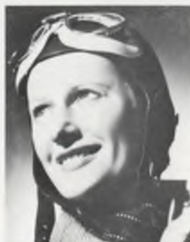
Nancy Bird Walton, yesterday