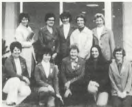
Saskatchewan Chapter in full force.

"REMEMBER SAFE FLYING & LET'S ALL GET APT!"