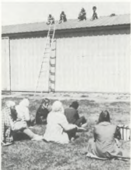
Believe it or not, this was the business meeting of the Maryland 99s on Cecil County Airmarking day! Four of the fifteen 99s who helped paint have ladder problems — two just could not climb up and the other two, once up, would not come down until the job was completed; one round trip was all they could make!

all over in their Cherokee Six; their most recent trip was to Cape Hatteras.