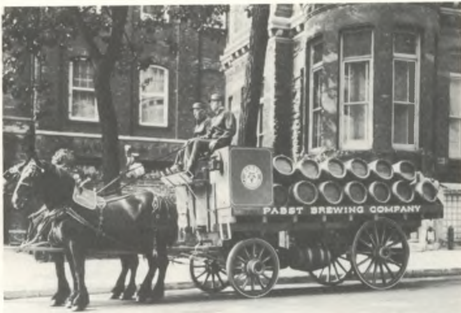
PHOTO OF THE PABST BEER WAGON —Shown here and on the cover is an exact replica of the wagons used by the brewery around the turn of the century. This is the Beer Wagon that will be used to greet the Ninety-Nines and their guests when they arrive at General Billy Mitchell Field in Milwaukee to attend the 1973 International Convention.