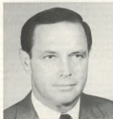
Alexander P. Butterfield, Administrator of FAA, will be guest speaker at the 99s International Convention. The Ninety-Nines organization is familiar with his high qualifications for this office, and eagerly await convention time to hear him in person.

MAIL TO: PFISTER HOTEL AND TOWER 424 EAST WISCONSIN AVENUE MILWAUKEE, WISCONSIN 53202