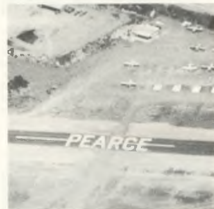
Pearce Field after Bay Cities Airmarking Lower Lake, Calif.