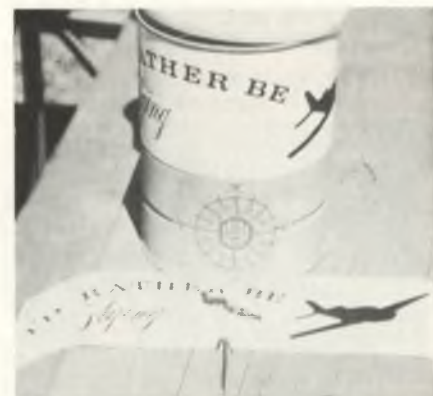
Bay Cities Worm "I'd Rather Be Flying" with worm cage. Entered with Fanfare at 3rd National Worm Races Clearlake, Calif.