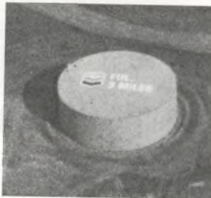
Airmarking done by Standard Oil, Western Operations on top of their storage tank 3 miles NW of Fullerton Airport, at the request of Orange County Chapter.

Wish the picture did justice to the airmarking job on the top of the storage tank near Fullerton. It's beautifully done in red, white, and blue and draws comment from strangers and locals alike. Airmarked rooftops are ideal as navigation and safety aids in low visibility, high density population areas like ours.