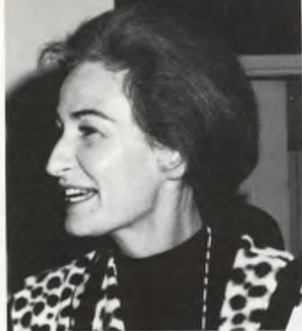
chapter chairman and treasurer, section secretary and vice-governor.