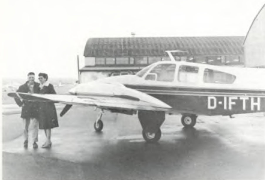
From Abandoned Baby to Adopting 40 Girls