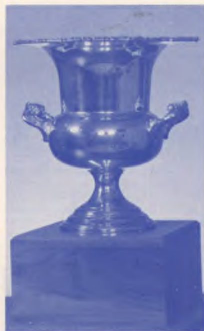
JIMMIE KOLP AWARD