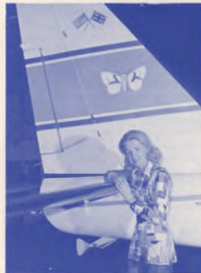
SHEILA SCOTT pictured with her Piper Aztec "Mythre" under the flags of Great Britain and the United States. These signify the co-operation of the two countries in a series of major scientific experiments using Sheila and her aircraft.