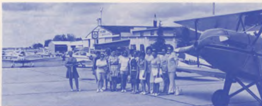
Wisconsin Chapter at Wausau meeting & antique airplane.

The picture indicates the enthusiasm of Wisconsin Chapter members who attended the Wausau meeting.