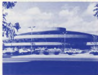
CENTURY II — Wichita Civic Center, where Aviation Leaders Banquet will be held August 14, during the International Convention of 99's in Wichita, Kansas, August 11-15, 1971.