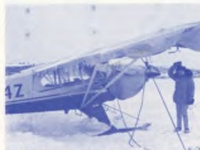
Winter wrappings on BLANCHE KRAGER and her Super Cub.

"This is how it is trying to fly in the winter in Alaska LOU WICKS , and all the rest of you Gals who have asked. We equip our planes with main skis and a tail ski, and when the plane is on the ground we put on wing covers, a windshield cover, and wrap the engine with an insulated cover. Inside the cowl a preheater is placed, which is turned on several hours or overnight before we anticipated flight to warm the engine and oil. I keep a quart of oil warming on the top of the furnace in my