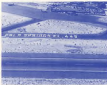
Aerial photo by Don Landells—Landells Aviation—taken from his helicopter shows the taxiway, runway and Terminal building, Palm Springs Airport.

PAT POLEN recently received her flight instructor rating and with her sister RITA, they're not yet twenty, are busy collecting shirt tails and skirt tails at their parents