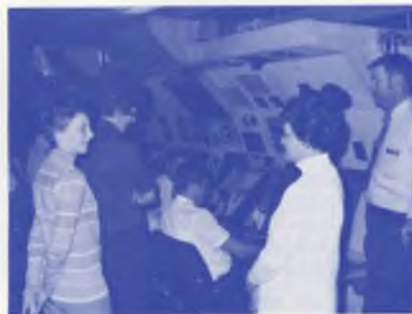
Tulsa Chapter members in radar room during tour of Tulsa International's Terminal Radar Facility. One of 23 such centers in the U.S.