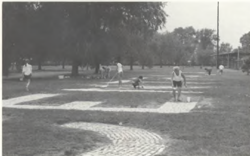
WOW! These letters are gigantic. Central Illinois Chapter airmarking at Centralia, Illinois.