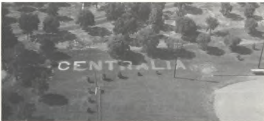
A view of the bricks in Centralia, Illinois before painting.

proud to say in a J-3 and not one of those triecycles.