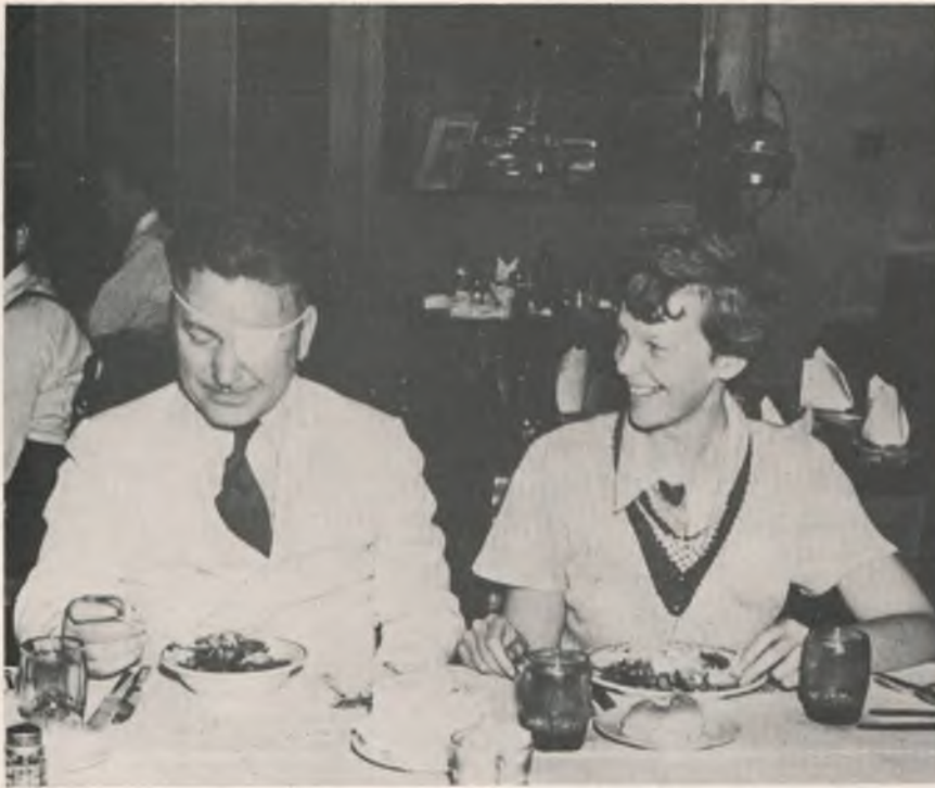
Another unpublished picture of Amelia Earhart. Here with Wiley Post. Dates and places unknown. Can anyone put the numbers to it? Maybe someone can identify the bird cage. Doesn't A.E. look young?