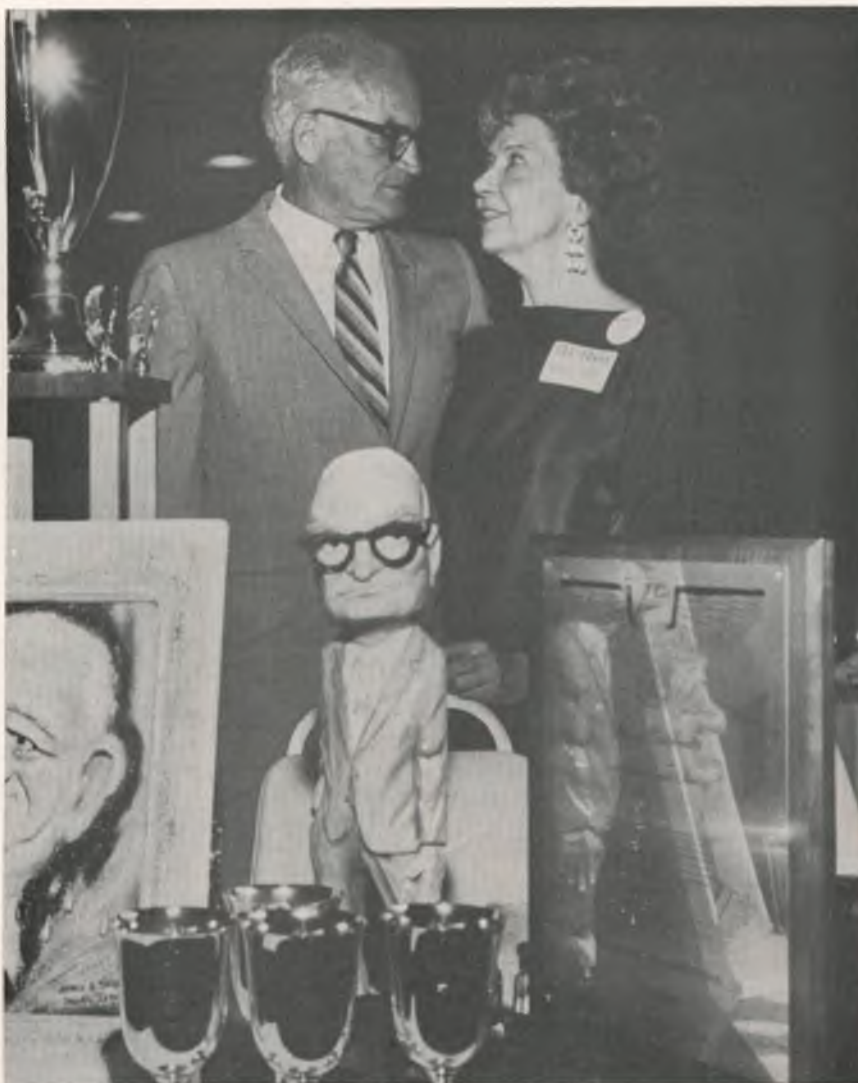
Senator Barry Goldwater & Jimmie Kolp being honored at Southwest Altimotive Service Center Invitation golf meet. They were honored as the outstanding man & woman in aviation. See special feature for story & additional picture.

Safe Flying!!!! See you in Tulsa at Daisies.