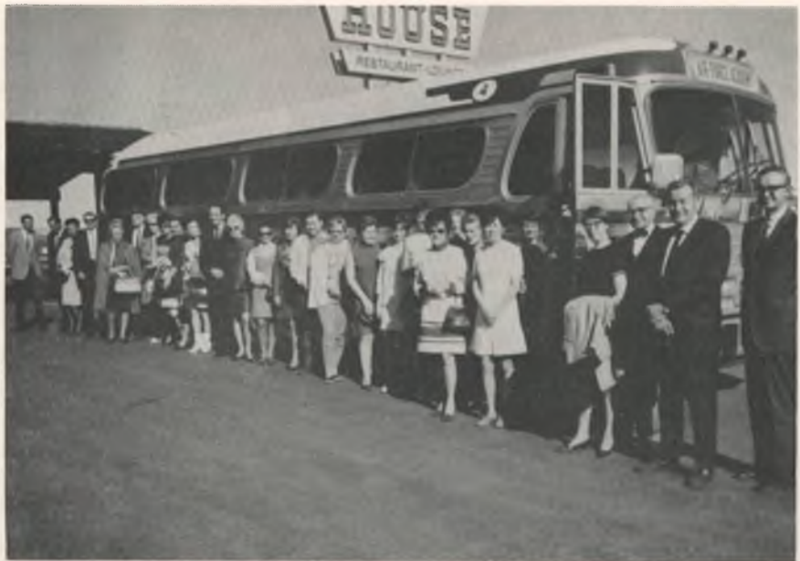
Pictured above are the Pikes Peak Chapter, Spanish Peaks Chapter, and Colorado Chapter, 99's and 49½ers, who toured the North American Air Defense Command Headquarters in Cheyenne Mountain at Colorado Springs, Colorado, on November 5, 1969.