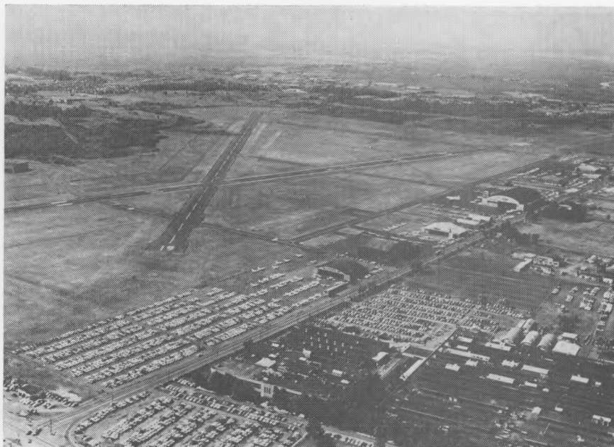
Aerial view of Teterboro Airport in Bergen County, New Jersey, looking east toward Manhattan.

There's a happening a minute in the world's most exciting city . . . and you can get in on as many of them as you want. Sneaking a peek at the entertainment that's in store . . . there'll be special style shows of clothes just for the woman who flies . . . tours of everything from the top of the Empire State Building to the bottom of the Village (if that's your cup of tea) . . . a look at the city by boat, or maybe even helicopter. In addition to all the regular events . . . we want to make this the best ever . . . and we don't think anyone will go home disappointed!