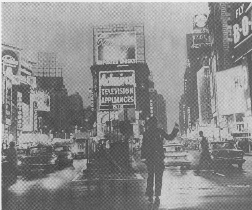
One of the nicest "happenings" in convention city is Times Square by night . . . just one of the things you'll discover when you come to New York for the 40th Anniversary— Remember July 9-13.

ALL CHAPTERS PLEASE REPORT ! LET'S HAVE 100% PARTICIPATION