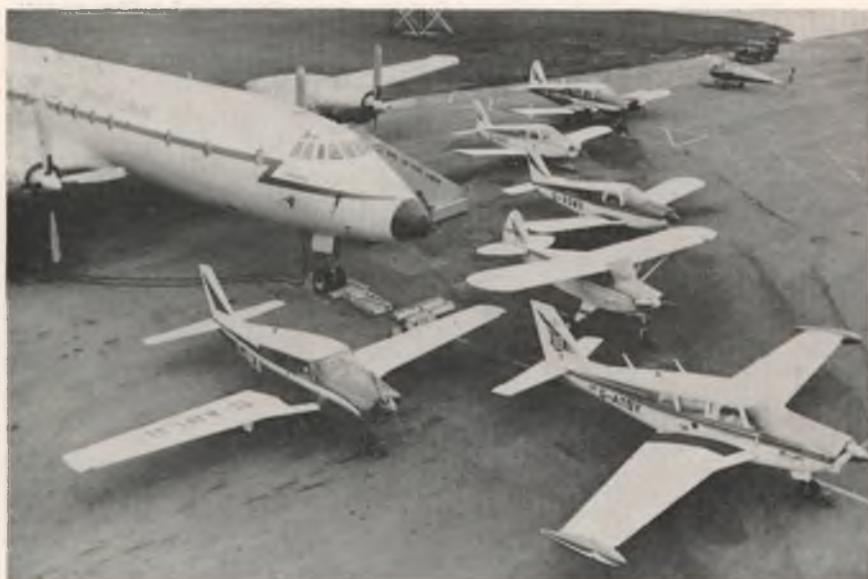
BRITISH 99'S VISIT RAF — Members of the British Section turned out in good force at a recent fly-in visit to the Royal Air Force Squadron 99 at R.A.F. Lyneham. Photo shows some of the Ninety Nines' aircraft parked beside the Squadron's huge Britannia. Front and center is SHEILA SCOTT'S famous Comanche, "MYTH TOO" which has crossed the ocean four times and set eight major world records. Brantly helicopter in the rear was also flown in by one of the English gals.