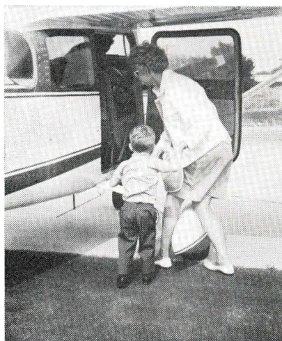
Passengers about to climb aboard for their 2c-a-lb. ride.

couldn't accommodate all, because whereas on Sat. we had 14 planes, on Sun. we had only 4 most of the day.