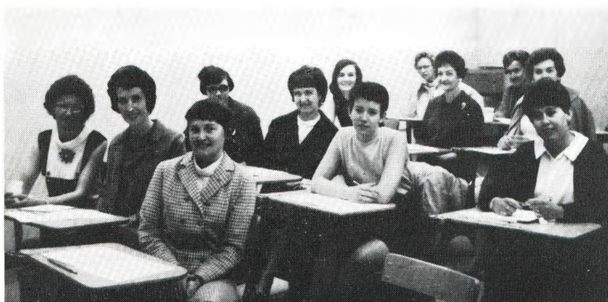
Classroom scene during the Offutt AFB Physiological Training Course taken by Nebraska 99s.