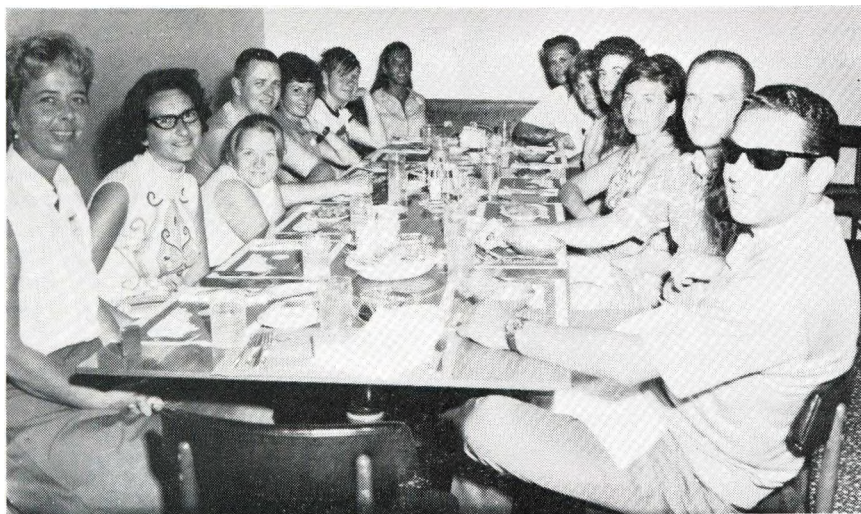
Kentucky Blue Grass Ninety-Nines at Rough River State Park.

By the time this is in print, we will have prepared our second annual send-off breakfast for the Experimental Aircraft Association's Flight to Rockford. In addition to the Experimental Aircraft on display, there will be an air show at Bowman Field. A day combined with work and play for the Ninety-Nines and we hope it also proves to be very successful.