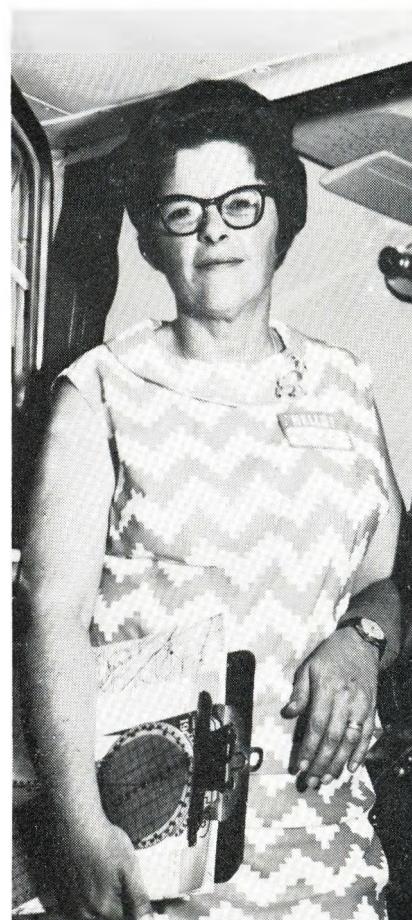
HAZEL H. McKENDRICK A. E. Scholarship

These four winners are women of whom we can all be proud! The fact that there are four scholarships to be awarded in 1968 is due in part to the Michigan SMALL Race Board. The A. E. Fund allowed three scholarships of up to $700.00. Because of the generosity of the Michigan SMALL Race