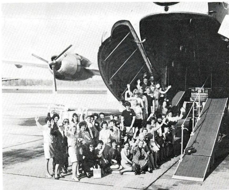
New England Section 99s and guests posed in front of a C-124, part of their tour of Hanscom Air Force Base, Spring Sectional, April 13, 1968.