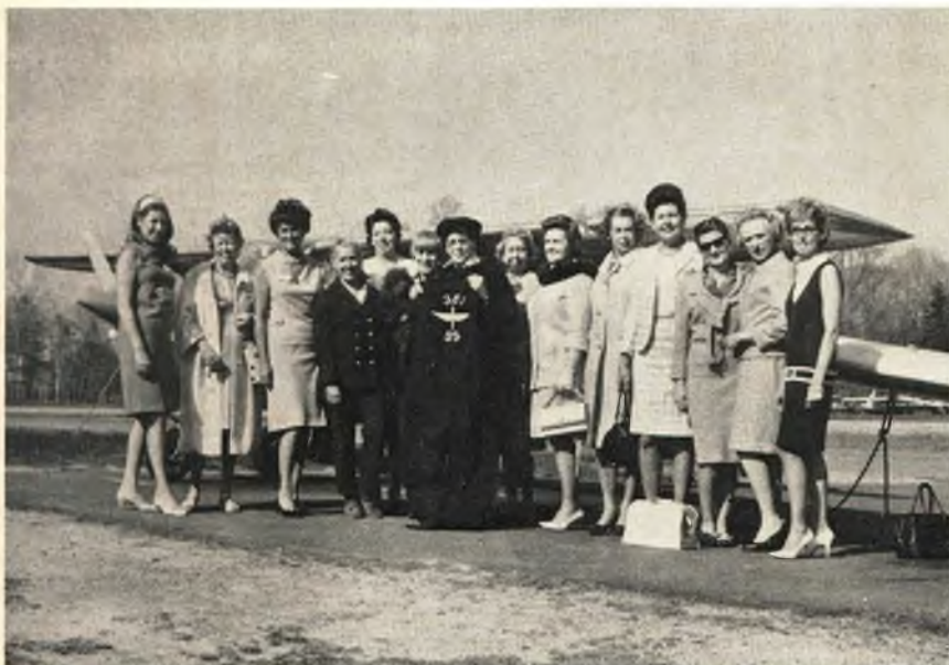
Members of the Greater New York Chapter who attended the Fly-In Fashion Show at the Flying W Ranch.