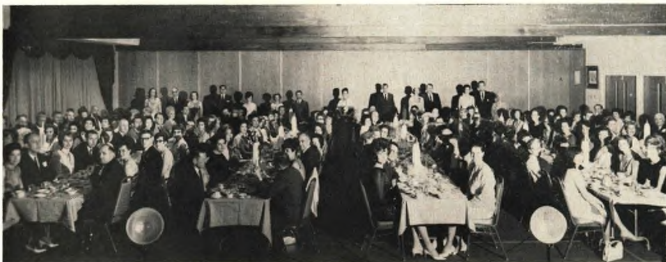
Proof of the better than 150 attendance at the TUL South Central Spring Sectional banquet. To those who didn't make it . . . ya should have! It was great!

some suggestions as to what type award would be good. If anyone has any ideas please contact her BEFORE AUGUST 1ST .