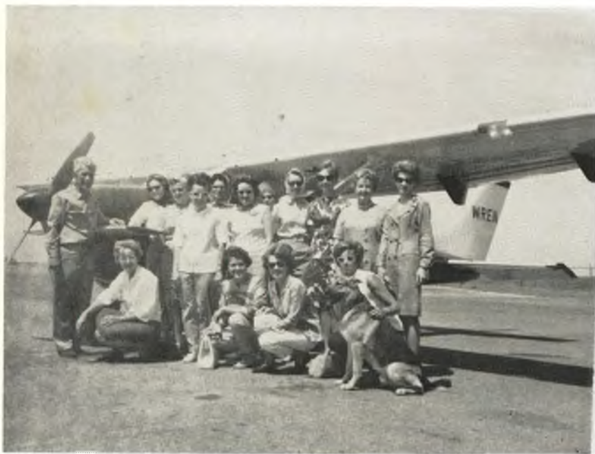
Recent visit to the Wren factory by members of the Ft. Worth Chapter.