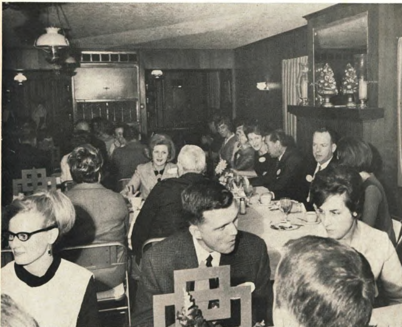
A scene at the Charter Presentation Banquet for the newly formed Topeka Chapter.