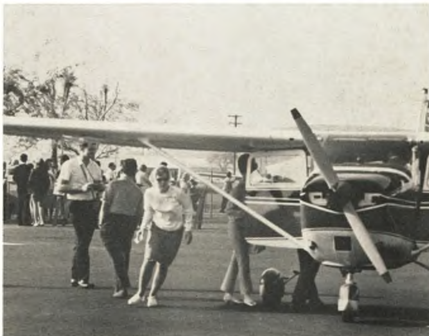
CHERYL COLLINS unloading passengers at San Gabriel 2 penny a pound.