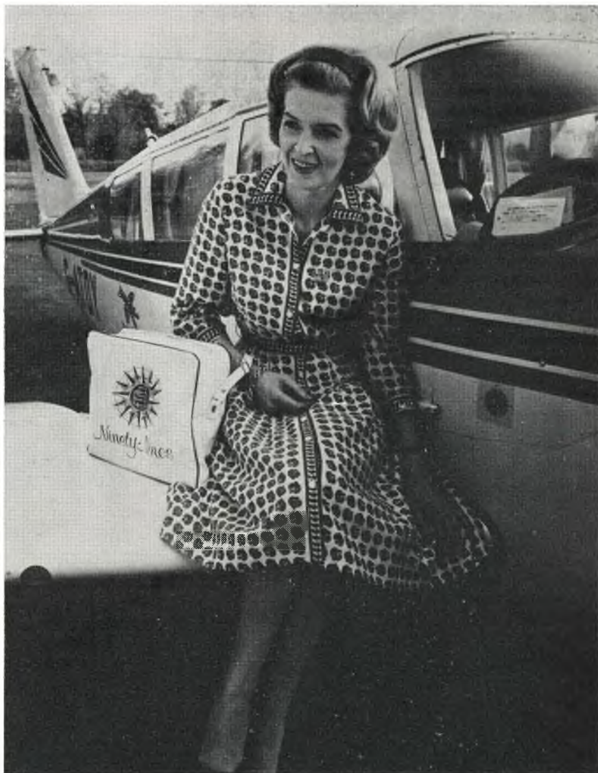
SHEILA SCOTT, British Section Governor, about to set off on her solo round-the-world flight.