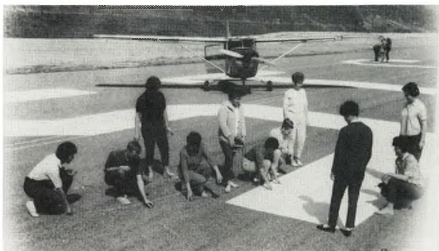
Utah 99s Air Marking St. George, Utah, Airport.

and elegance of the furnishing and decoration of the old home, surrounded by acres of beautiful trees, rich in their autumn colours, made a perfect setting for THEIR EXCELLENCIES who entertained 180 guests, whose love is flying, and who now have another memory of THEIR EXCELLENCIES' kindness and charm, a quality we have all long known and admired, but this time, in a setting of roses by candlelight from silver candelabra, crested china and liveried staff, beautiful pictures and soft carpets and quantities of superb food such as I have never before seen or tasted.