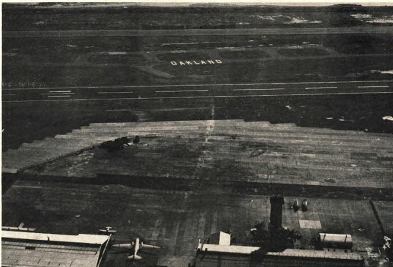
Oakland airmarker completed by Bay Cities Chapter Jan. 8, 1966. Located between runways 27L and 27R it covers 6,500 sq. ft. with 50' letters in white.

Section Chapters completing an air-marking.