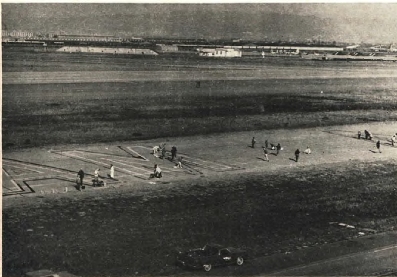
Bay Cities Chapter 99s, Feb. 12, 1966, working on layout, outlining and filling in "NAS ALAMEDA" airmarker.