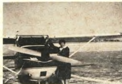
JEAN HAUSER, Wisconsin Chapter, whose determination to fly has overcome a deaf handicap.

A beautiful day for flying brought 36 people to the Fond du Lac Airport