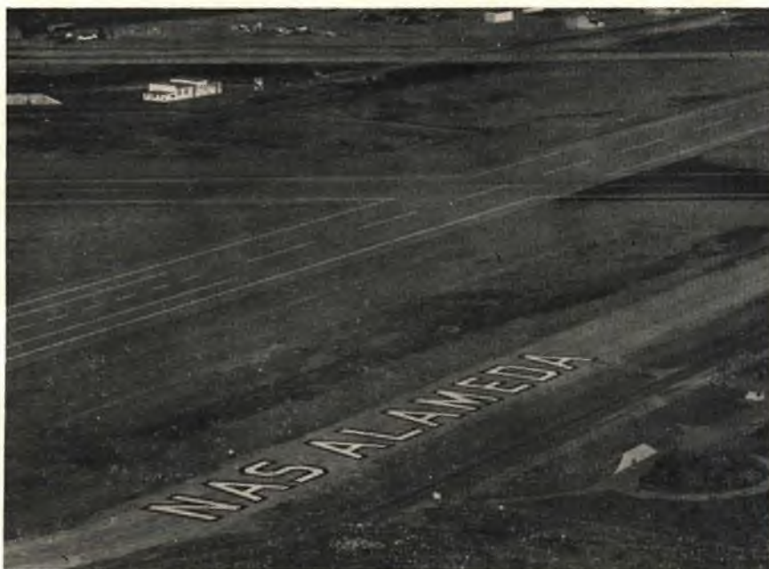
The Alameda Naval Air Station airmarker covers 20,290 sq. ft. Located on Taxiway No. 1, the 70 foot letters are yellow outlined in black. Completed Feb. 22 by Bay Cities Chapter, this is believed to be the first military airfield in U.S. airmarked by Ninety-Nines.