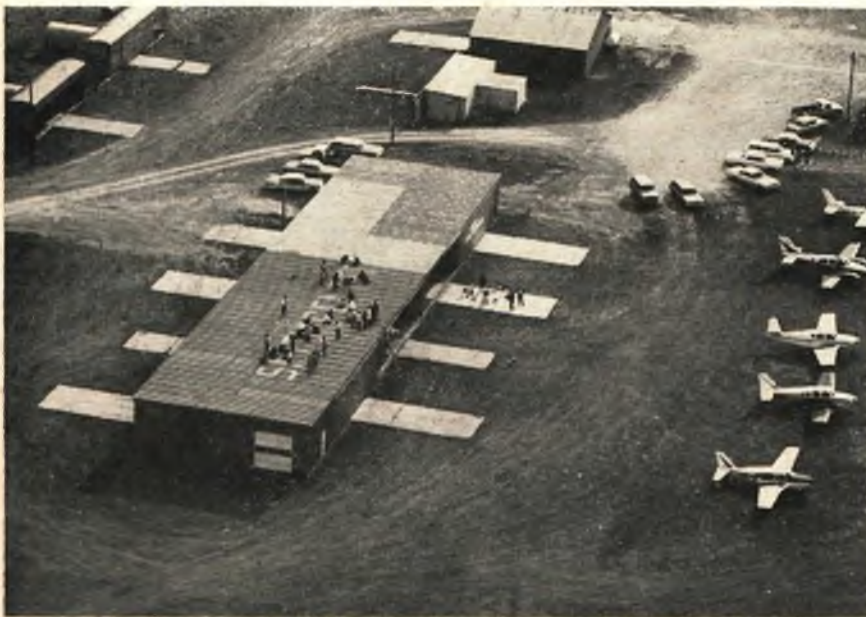
Aerial view of airmarking done at Smith Center, Kansas, on November 20th by the OLIVE ANN BEECH Wing Scout Troop No. 149 and the Kansas 99s.