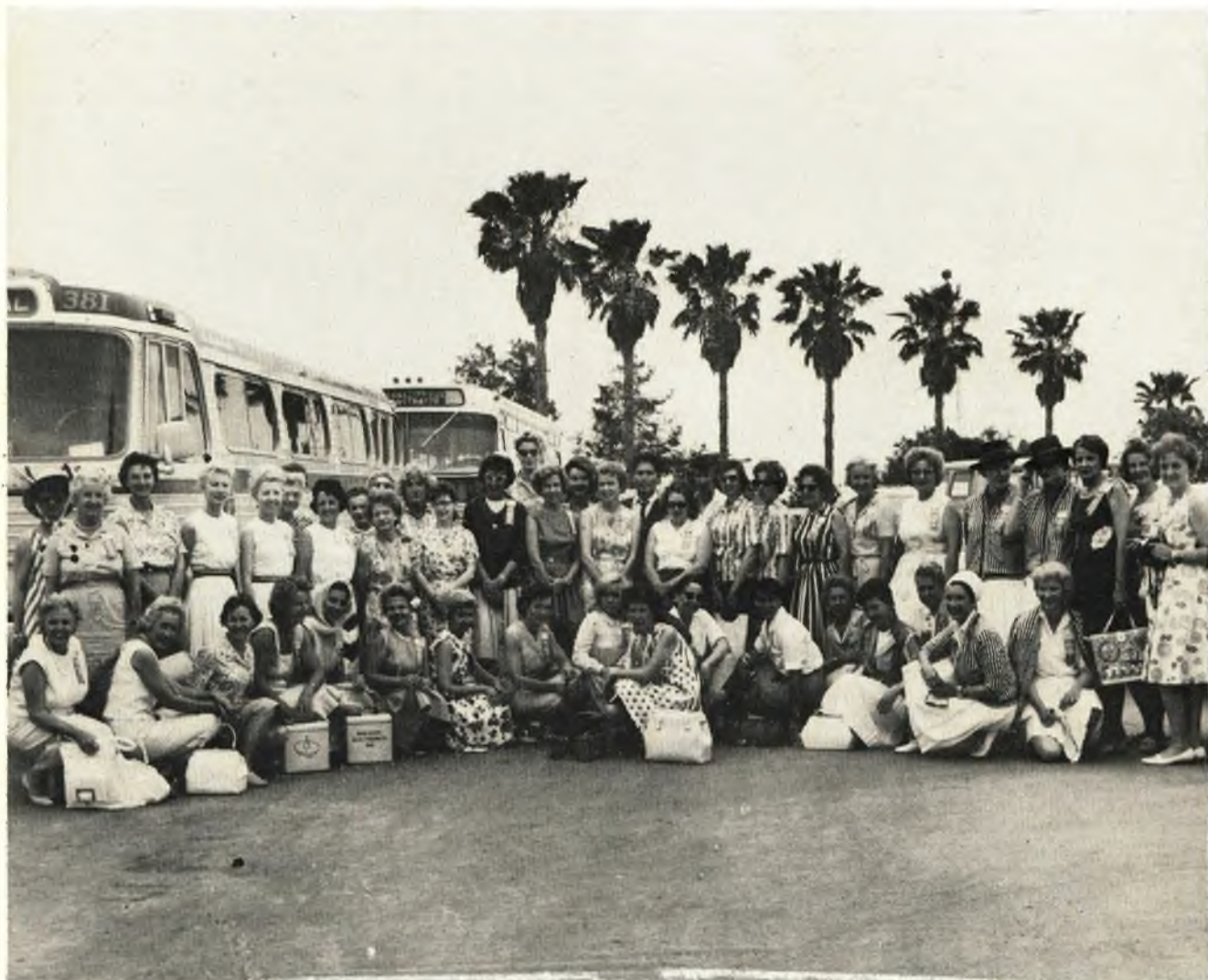
Arrival at Monterrey Airport — Contestants and Officials in AWTAR