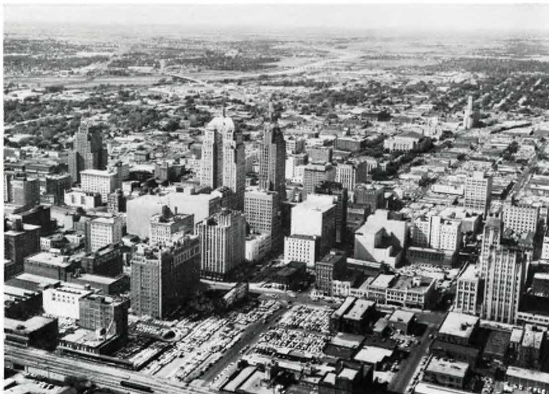
Oklahoma City is "Mighty Pretty." This aerial view shows the heart of the city, looking southwest.