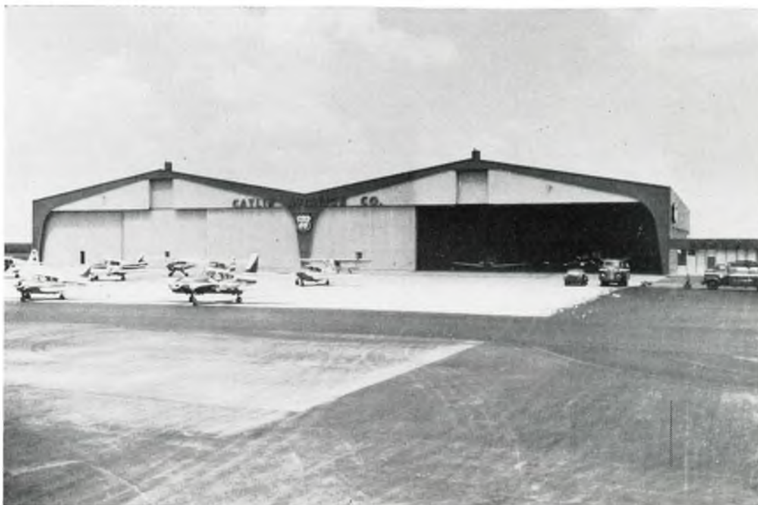
The Catlin Aviation Co. on Will Rogers Field is the official facility to serve you and your aircraft. Special preparations are planned to provide transportation for you and your passengers from this hangar.