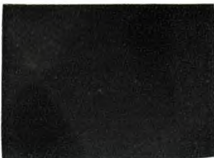
But the race course instructions say it should be a RED roof!