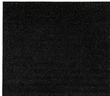
Preview of Race Course OKC FUN FLYING SPREE

BEES, BIRDS & BUTTERFLIES WILL BE PEOPLE WATCHING JULY 17th — WATCHING THE GALS IN THE "OKC FUN FLYING SPREE".