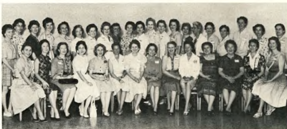
South Central Section 99's at Spring Sectional meeting in Stillwater, Okla.