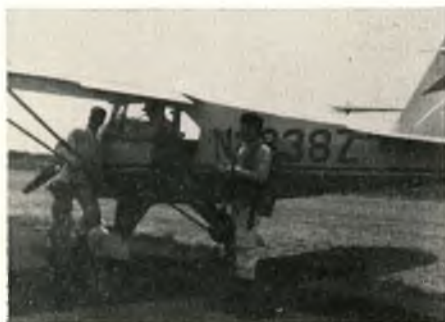
Mitzi Hutchinson of Blackfoot, Idaho, just before making her first free fall. Mitzi has made five parachute jumps to date, which included one at Armed Forces Day in Pocatello.

land and back via the freeway system. The smog lifted in the afternoon giving us a wonderful view of the ocean and entire L. A. area. When leaving we also had a clear day (we had seen nothing but a few peaks beyond Fullerton when arriving). Gloomy weather predictions did not materialize except for the Helena-Dillon leg, which was very rough, otherwise the flight was one you always wish for—smooth and tail winds and sunshine most of the trip both ways. We made use of the VFR radar advisory service going through the Salt Lake - Hill AFB area, a most comfortable feeling to have that radar eye on us. I had forgotten my 99 directory, so did not get to call anyone while there. If you have not been to Disneyland and Marineland I would certainly recommend it for the whole family."