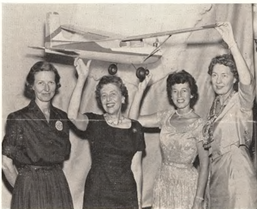
INTERNATIONAL OFFICERS FOR 1959-1960

We are hoping this year to prepare a film—color and sound—that will adequately portray all the facets of Ninety-Nines activity. In order to cover all the various activities and spread the expense we believe that different chapters might be able to supply footage depicting a particular activity in which they have been successful; such as: air marking, competition, air age education, etc. The combined footage could then be edited, sound track added and copies be made available for our own use