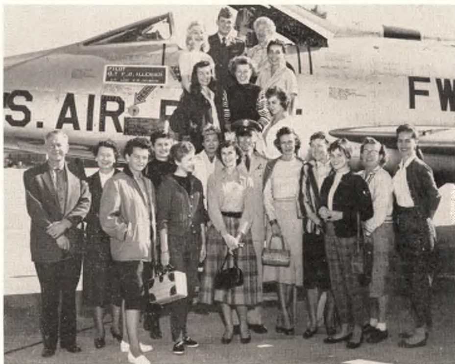
A group of girls inspecting the F-102 at George Air Force Base

The George Air Force Base visit November 15th was cancelled due to bad weather. On the eve of Nov. 14th what a ball we had notifying some 102 girls from the Southwest Section of the cancellation. Our apologies to those few hardy ones we couldn't reach and arrived in spite of the weather — perhaps we shouldn't, because the Air Force treated them royally. Just imagine 4 women marooned among 4000 men, it certainly couldn't be called the lost week-end. The rain date Nov. 21 found CAVU weather and some 54 girls on hand at George Air Force Base. Upon arriving we were briefed by Major Risner on Tactical Air Command operation as they apply to George. We were then taken on a tour of the base and introduced to the F-1000 flight simulator which a few lucky 99s were able to try to fly. The Air Force then put on an air show of 4 F-100s and 2 F-104s. During lunch we were addressed by Col. George Laven Jr. the C.O. of the base on Air Defense Command operations. After