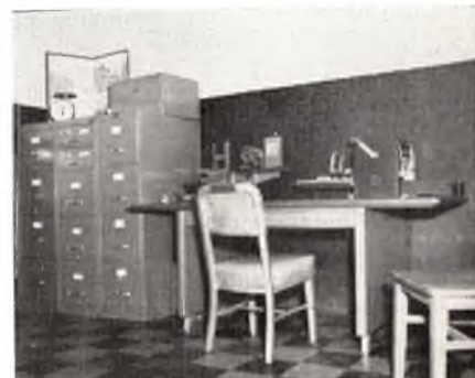
Another view of the working part of the office showing the membership files, addressograph and the mimeograph.