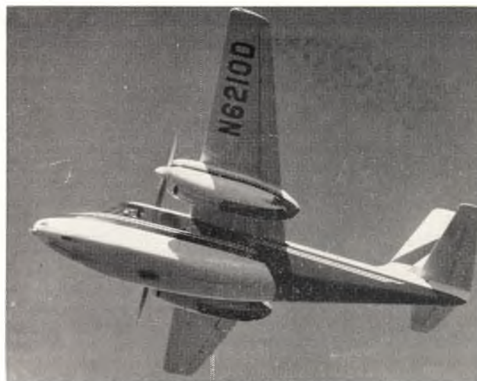
Record Breaking Aero COMMANDER