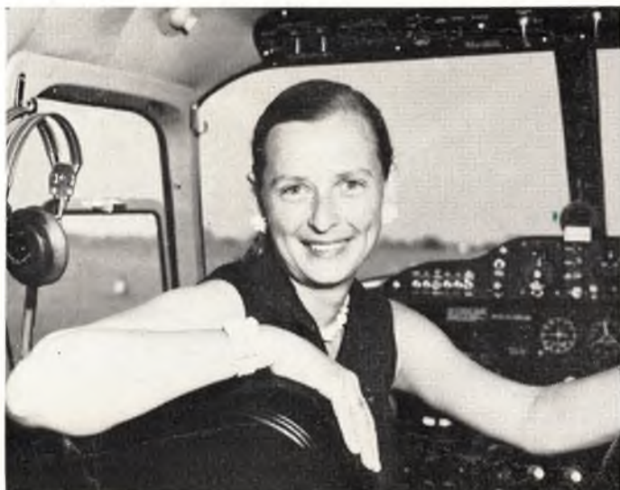
Jerrie Cobb, Ponca City, Oklahoma