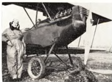
EDNA GARDNER WHYTE took her private flight test in this nice airplane.

With warmer weather here again we will very soon be at it again with brushes and buckets of black and yellow paint. After all we don't want you to get lost when you come