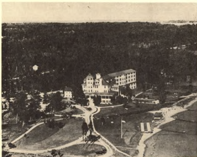
Convention site - Ramona Park Hotel, Harbor Springs, Michigan