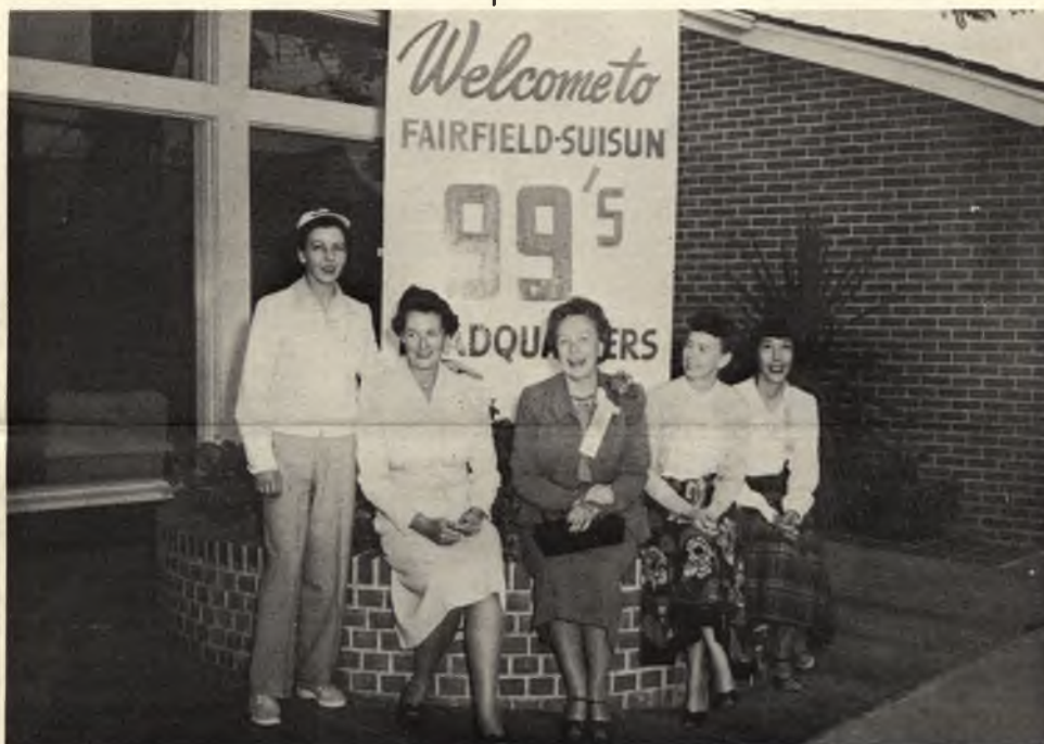
SOUTHWESTERN SECTION SPRING SECTIONAL - TRAVIS AIR FORCE BASE Sacramento Valley Chapter - Hostess

NOTE: Sacramento Valley Chapter is offering a prize to the Chapter that has the greatest percentage of attendance at the International Convention at San Diego, California. Delegates please bring letter from Secretary of Chapter stating number of members in good standing as of July 1, 1953.*****