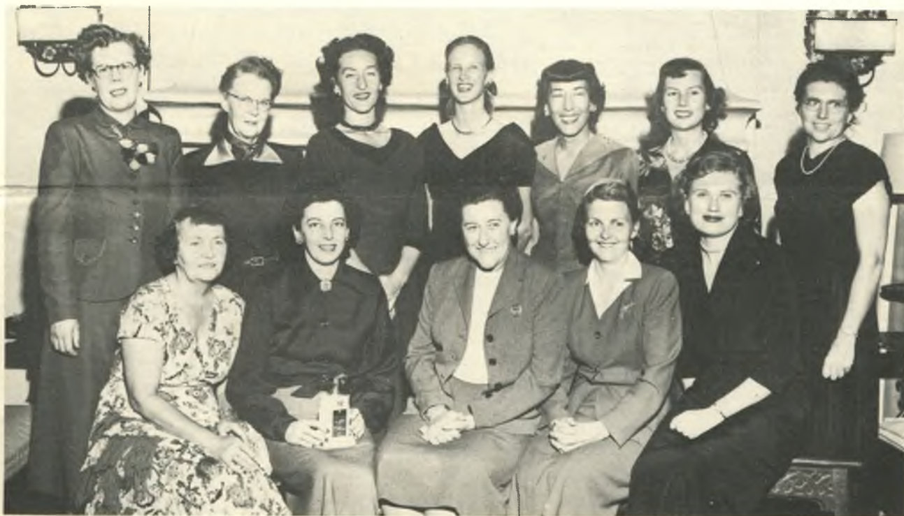
NINETY-NINES ATTENDING PRESENTATION DINNER AT TUCSON, NOV. 8, 1952