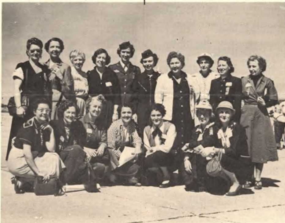
NINETY-NINES AT THE TAKE-OFF OF THE 4th ANNUAL ALL-TEXAS AIR TOUR